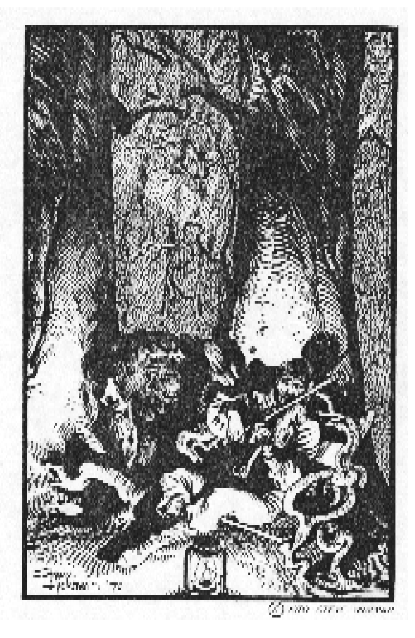
All ready for filking?