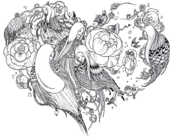
Art © Victo Ngai

For those who need it or are interested, there is a Braille Copy of the Pocket Program at the Information Desk.