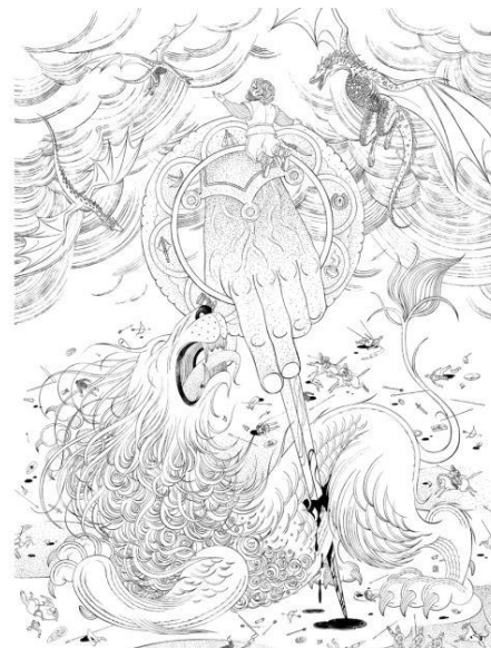
ART © Victo Ngai