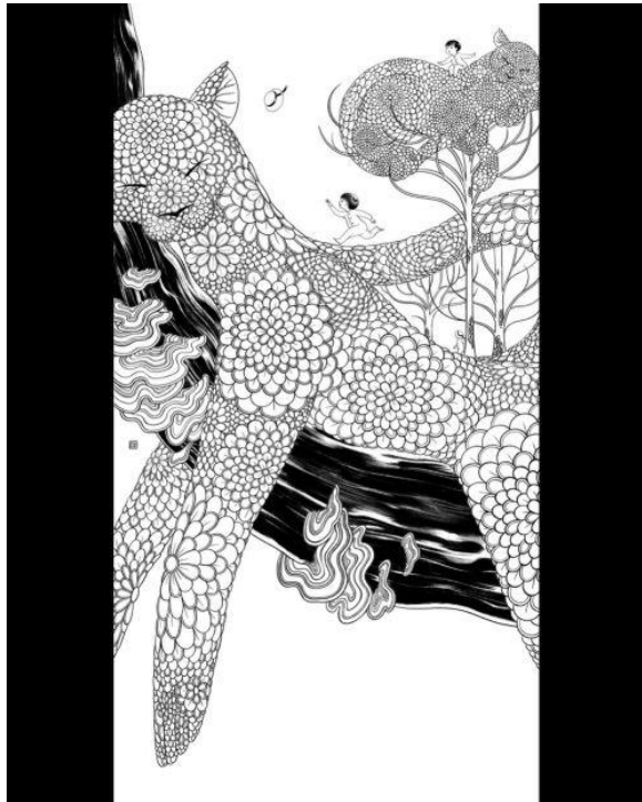
Art © Victo Ngai

For those who need it or are interested, there is a Braille Copy of the Pocket Program at the Information Desk.