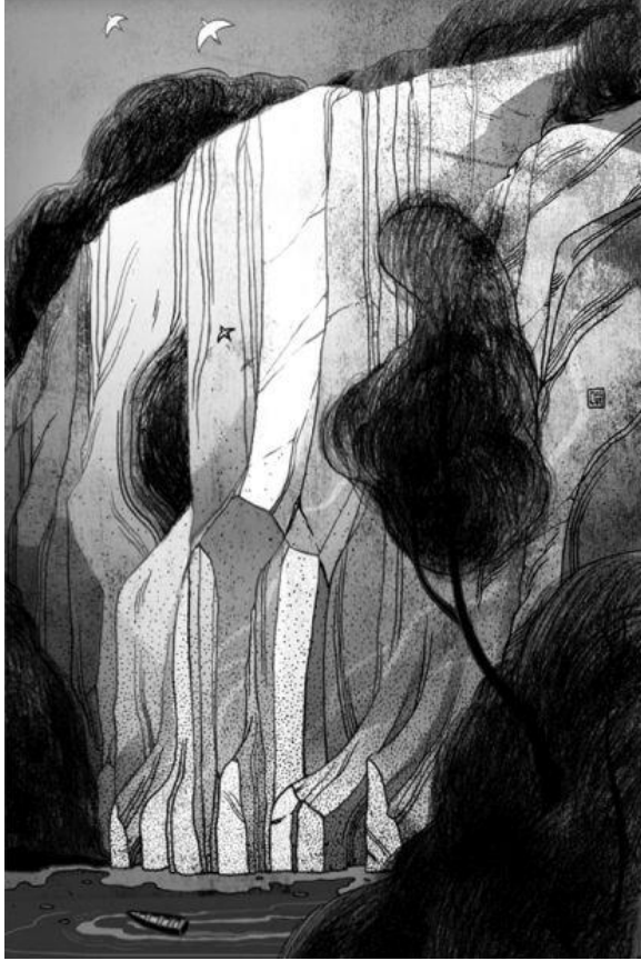
All art © Victo Ngai

HELMUTH 60 NUMBER 3, SATURDAY PM 18 FEBRUARY 2023