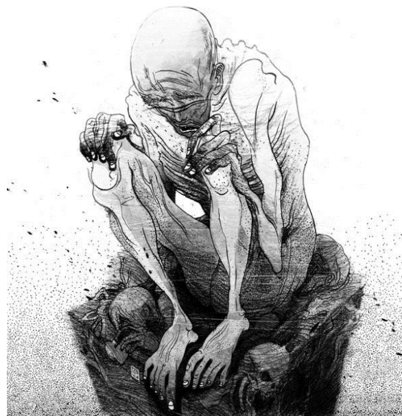
All art © Victo Ngai

Farewell from Boskone 60. See you next year at Boskone 61.